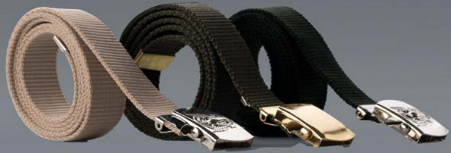
OFFICER BELT & BANDOLEER